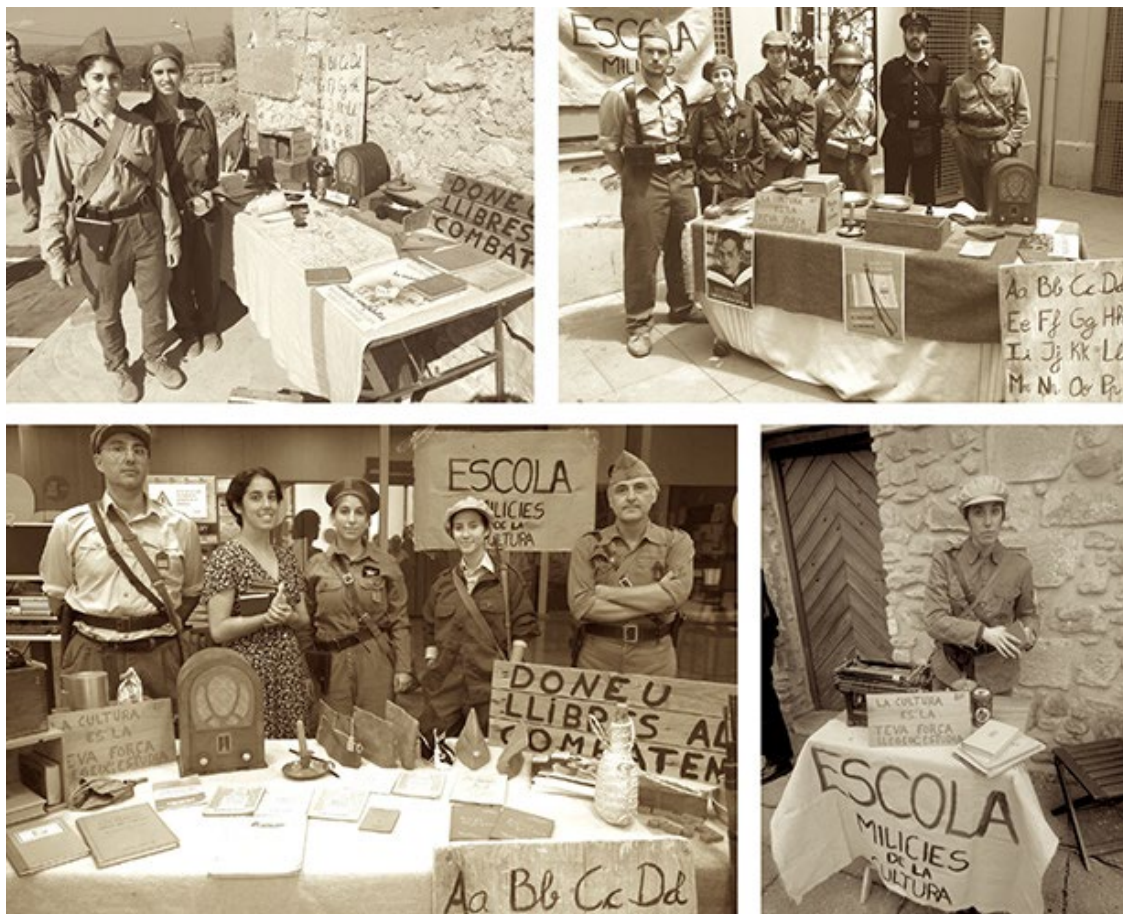
Figure 4. Recreation of the militias of culture, in a commemorative event, 2017.

carried out was the Spanish Civil War, and obviously, a war cannot be studied outside of its military component. However, it is no less true that a war cannot be understood, considering only the military variables. The re-enactment activities that typified the service-learning experience incorporated elements of war, but also non-war variables. Thus, the re-enactment activities emphasized different presentations, in which visitors could partially contemplate or experience realities that made up a civil perspective on the war. During war times, there are men and women doing activities to support and to be with other people so much as to maintain life and health. Enhancing human solidarity even in these difficult circumstances shows the other face of war. The DIDPATRI group had considerable experience in this field. It had developed museographic projects on the heritage of the conflict that gave relevance, precisely, to the civil dimension, following the example of proposals such as Peronne's «Historial de la Grande Guerre»; or «Flanders Field» by Ieper. (Feliu, 2011; Íñiguez-Gracia & Hernández-Cardona, 2004; Muchitsch, 2014).