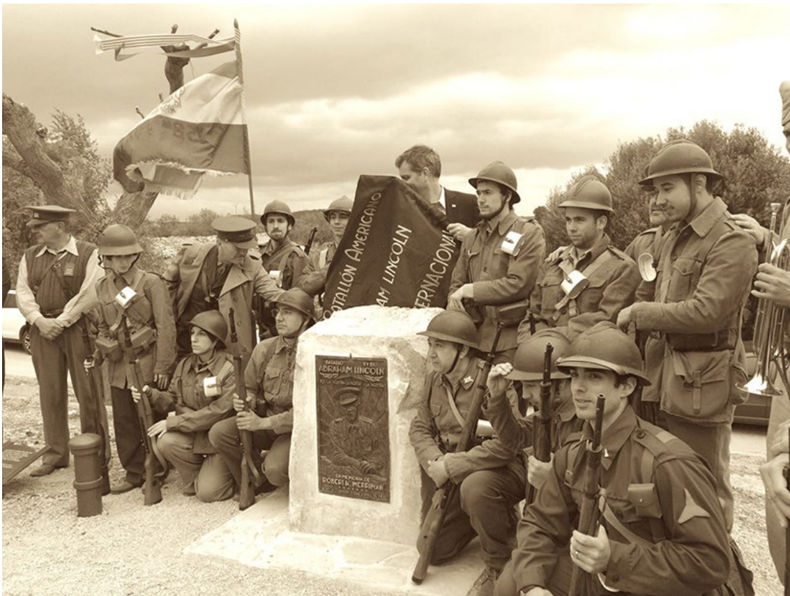
Figure 7. UB reenactors at the inauguration of a sculpture in memory of the combatants of the Lincoln Battalion, in Corbera d'Ebre, 2018.

— To these actions must be added many other participations in activities organized by civic and re-enactment associations: the recreation of the Ebro pass in Miravet (Tarragona) in July 2018, the recreation of the bombings in the town of la Granadella (Lleida), annually since 2015, the recreation of the Republican NCO School of Tudela de Segre, annual since 2016. The recreations of the trenches of l'Ordal (Barcelona), carried out since 2016. The recreation of the 27th Division camp in Robres (Huesca) in the years 2021 and 2022.