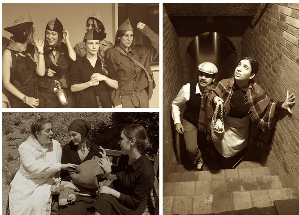
Figure 1. Re-enactment practices in the Master of Heritage Management and Museology at the University of Barcelona (2015).

In this sense, the design of re-enactment activities carried out by university students could be of great help in actions to recover and dignify the memory of the Spanish Civil War that was carried out in museums, monuments or archaeological sites. The students mainly belonged the Master's degree in Heritage Management and Museology, and the Primary Teacher Degree from the Faculty of Education, although students from various specialities from the Faculty of Geography and History.