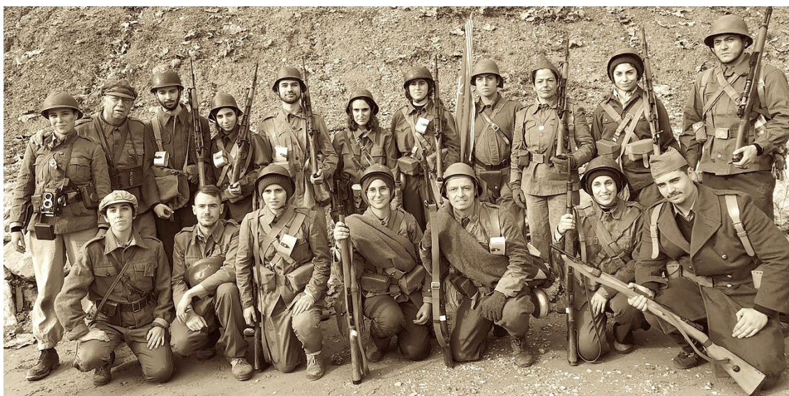
Figure 6. University re-enactors. Flix, 2018 «The last day of the Battle of the Ebro».

— The municipality of Flix was another of the places where interventions were made repeatedly, along with other re-enactment associations. In the castle of Flix, the DIDPATRI group erected a monument in memory of performing the bridge-building engineers of the Republican army during the Battle of the Ebro. Since 2015, re-enactment days have been held to remember the Republican withdrawal of November 1938.