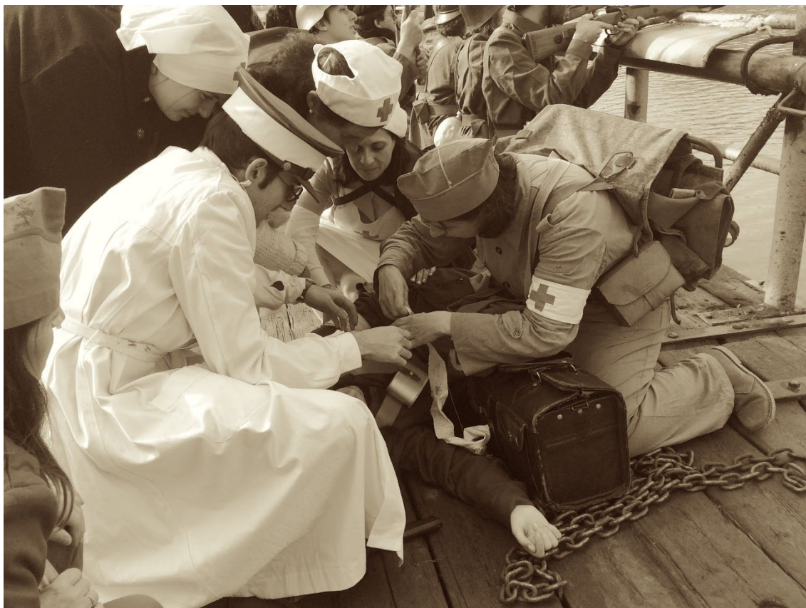
Figure 5. Reenactment of war healing. Collaboration of DIDPATRI with the groups «Ejército del Ebro» and «XV Brigada Mixta».

There were also small re-enactment exhibitors on food, passive defence, the prevention of chemical warfare, the organization of public schools (a movement called «Consell de l'Escola Nova Unificada CENU»), on the role of women in war etc. Naturally all re-enactment activities also had a military dimension: recruiting offices, training, description of weapons and equipment. To include real these actions in exhibitions, transform the understanding of historical events in a more human way.