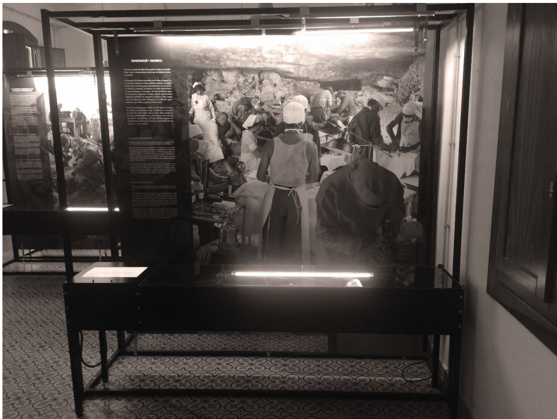
Figure 8. Museography of the Hospital del Molar (Tarragona), in collaboration with the recreation group «Ejército del Ebro», 2018.

Finally, it should be noted that recreation was also used preferentially in some museographic proposals. The most important was developed at the «Centre d'Interpretació de l'Hospital del Molar». The Molar museographic proposal (Tarragona) was implemented in the management building of an old mine that, during the Battle of the Ebro, became a field hospital for the Republican army. In preparing the museographic proposal, re-enactors were used to get video images of field hospitals, surgical operations (following the «Trueta» method), and the organization of the republican health system during the battle. The images were also used extensively in the graphic production of the exhibition. The iconography generated from the recreation, adjusted from the matte painting treatment, played a decisive role and the centre became a pioneering experience of a museographic space structured by images from historical recreation activities. (Sospedra et al., 2020).