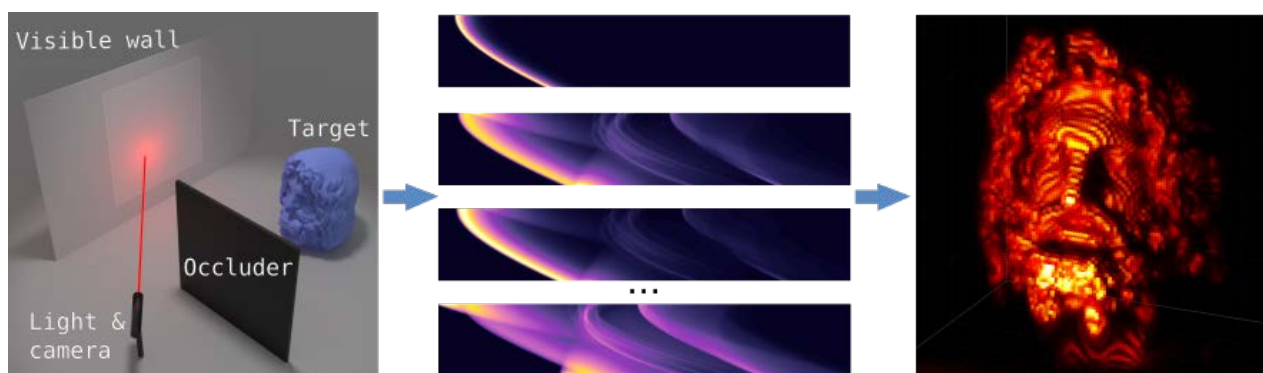
Figure 2 The input scenes contain a virtual capture and illumination device aiming at a visible wall or planar surface. We then simulate a grid of points on this surface to produce time-resolved images. These are used by reconstruction algorithms to get probability volumes.