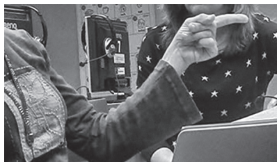
b) "If we go after her"