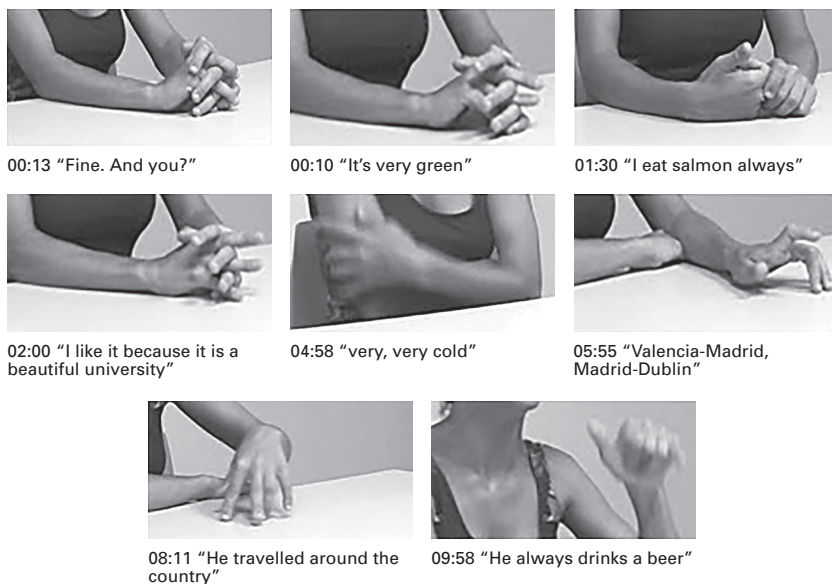
Figure 4. Time sequence for gestures for the interview in English.

The same procedure followed with the subject’s mother tongue (Spanish) was used for the tests in English. Taking the English tests after the Spanish ones allowed the student a better comprehension of the task when dealing with the foreign language, thus reducing anxiety.