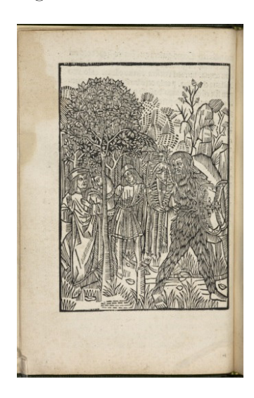
Fig. 2: The Auctor encounters Deseo and Leriano. Cárcel de amor, Burgos, 1496, a2v. © The British Library board (Shelfmark IA 53247)