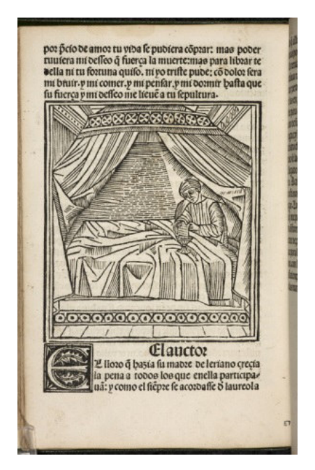
Fig. 7: Leriano prepares to ingest letter. Cárel de amor , Burgos, 1496, g7v. . © The British Library board (Shelfmark IA 53247)