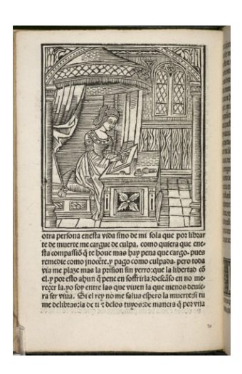
Fig. 5: Laureola writes a letter. Image printed once in the extant portions of Cárrel , Zaragoza 1493 and three times in the Barcelona and Burgos editions. Cárrel de amor , Burgos, 1496, d5v. © The British Library board (Shelfmark IA 53247)