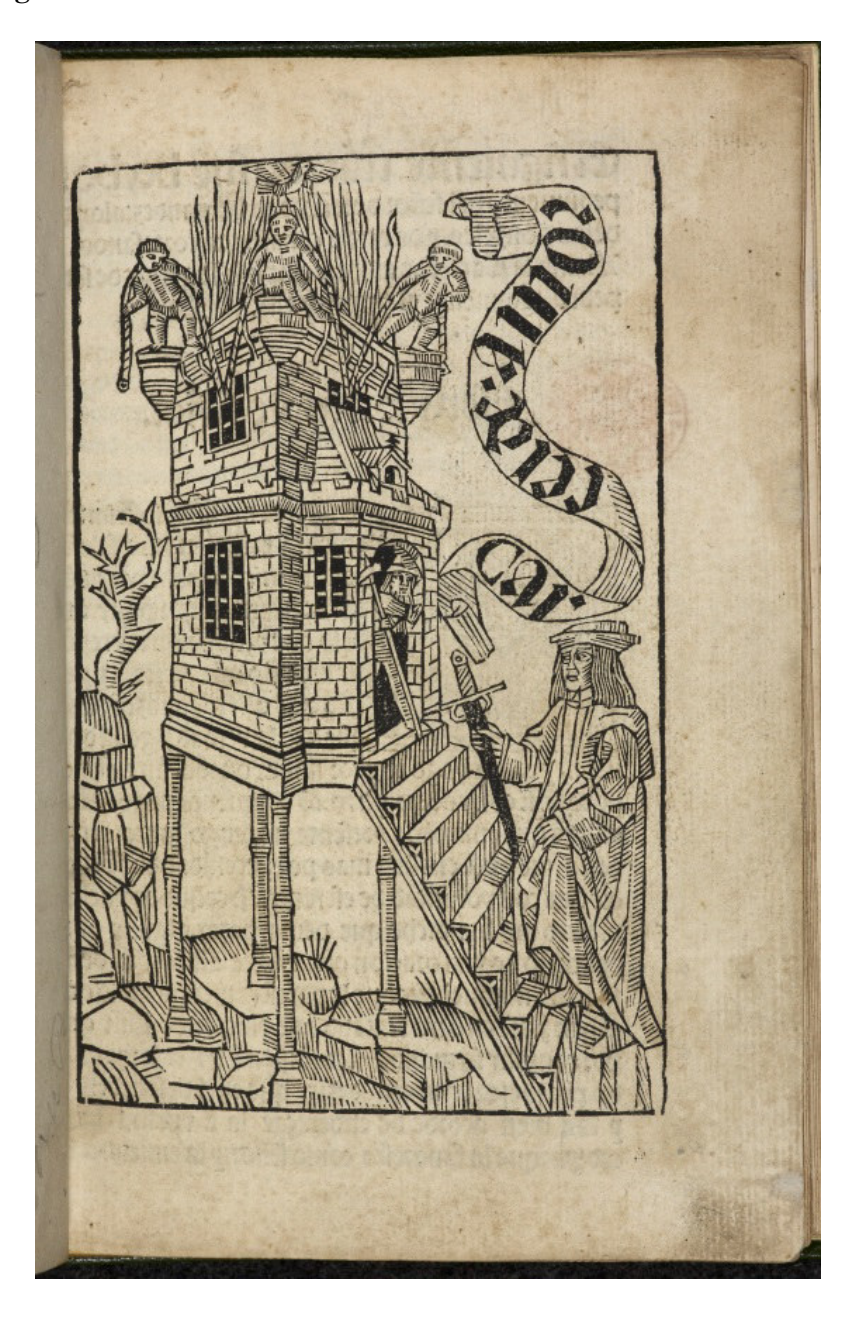
Fig. 1: Title page. Cárcel de amor, 1496, a1<br/>r. (Shelfmark IA 53247)