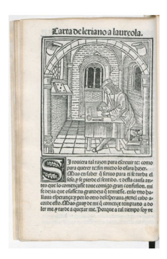
Fig. 4: Leriano writes a letter. Image printed three times in the extant portions of Cárrel de amor , Zaragoza 1493 and seven times in the Barcelona and Burgos editions. Cárrel de amor , Burgos, 1496, b4v. © The British Library board (Shelfmark IA 53247)