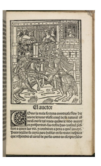
Fig. 3: The duel. Cárcel de amor , Burgos, 1496, c7r. © The British Library board (Shelfmark IA 53247)