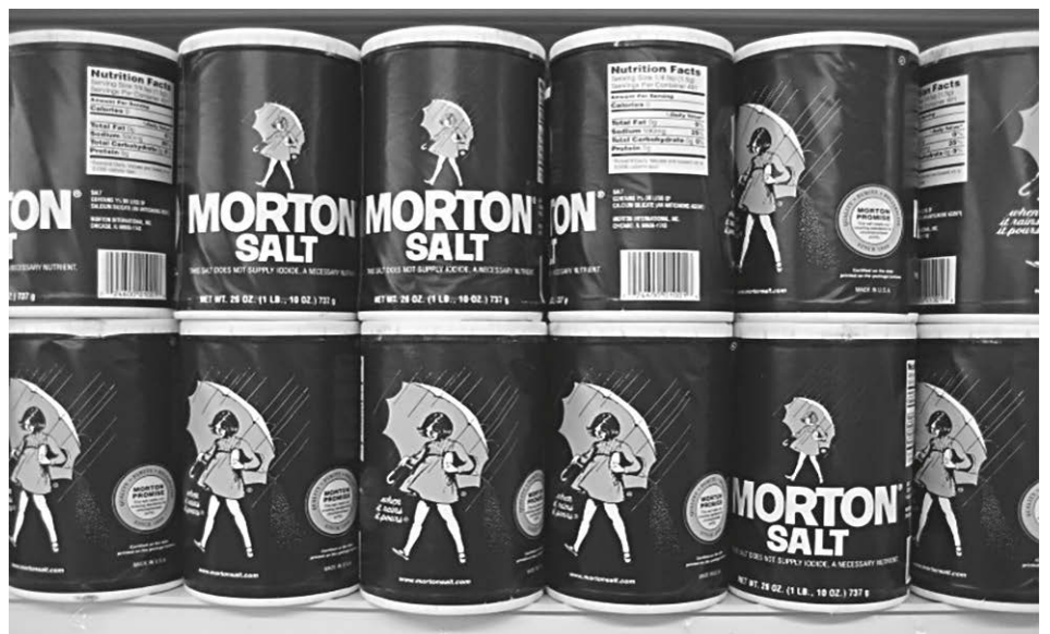
Figure 6. Iodized salt on a store's shelf.

This paper aimed to review and analyze the evolution, role and pertinence of Mediterranean saltscapes, with the help of Portuguese case studies. It was argued that many of these saltscapes have been threatened by global economic transformations (Figure 6.), changes in employment patterns, laboring technologies, lifestyles and the encroachment of urbanization, potentially leading to their irreplaceable destruction if collaborative planning among stakeholders does not occur or is not fully embraced. The sustainable development of saltscapes needs a holistic and multidisciplinary approach. The planning implications are fourfold: Firstly, the need to maintain the ecological value of saltscapes; secondly, the need to preserve the man-made constructions integral to artisanal salt harvesting practices; thirdly, the need to stimulate the economic viability of artisanal salt production; and fourthly the need to promote collaborative global knowledge exchange networks. Finally, it is also important to find sustainable touristic, aesthetic and cultural strategies to preserve the patrimonial value of salinas. Future research ought to investigate these planning implications. In addition, it is important to devise responsible ways to maintain salinas' invaluable contribution to the history of our human relationships with the water-land interface.