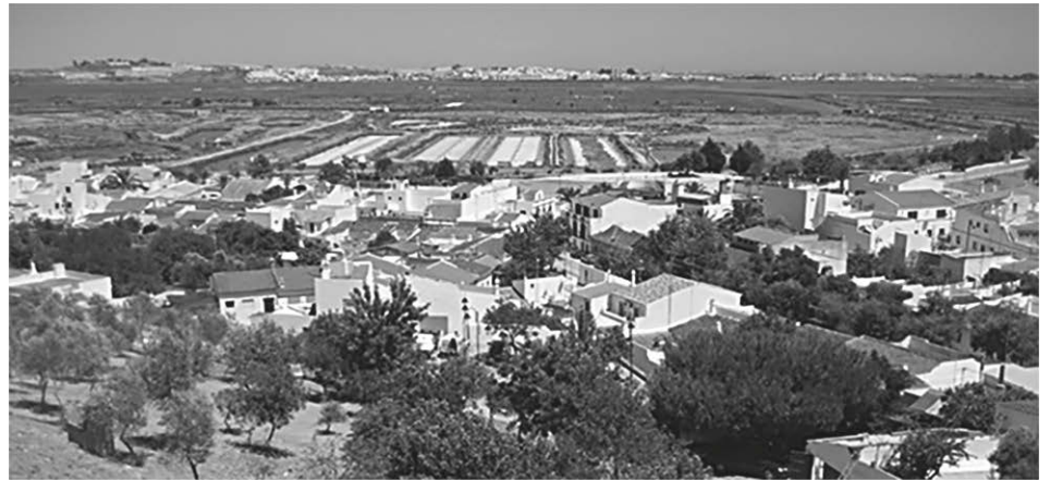
Figure 5. Town of Castro Marim in Algarve.

castle with a vast area occupied by the nature preserve “Reserva Natural do Sapal de Castro Marim e Vila Real de Santo António” (RNSCMVRS) and the newly restored salinas and marshes in the foreground, and the Spanish territory at a distance in the background. 41