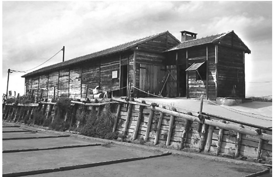
Figure 3. Traditional Salt Warehouse.

This decline in production was partially circumvented with a municipal intervention aimed at revitalizing the salinas for cultural and tourism purposes, which included the upgrade of a model salina and the building of a salt museum (Figure 4.). The enhancements were financed in part with funds from the European Union and Figueira da Foz has been a member of the ALAS European network of salt producing regions since its inception in 1999. The goal of this network has been to augment the understanding of the value of salt and of saltscapes in today's society.