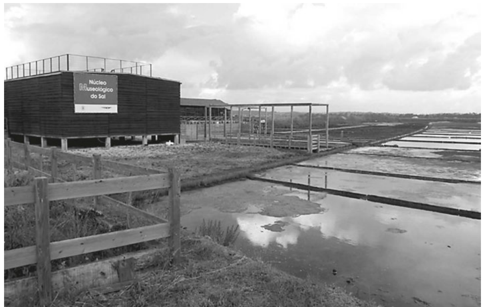
Figure 4. Eco-museum in the Mondego Estuary.

This decline in production was partially circumvented with a municipal intervention aimed at revitalizing the salinas for cultural and tourism purposes, which included the upgrade of a model salina and the building of a salt museum (Figure 4.). The enhancements were financed in part with funds from the European Union and Figueira da Foz has been a member of the ALAS European network of salt producing regions since its inception in 1999. The goal of this network has been to augment the understanding of the value of salt and of saltscapes in today's society.