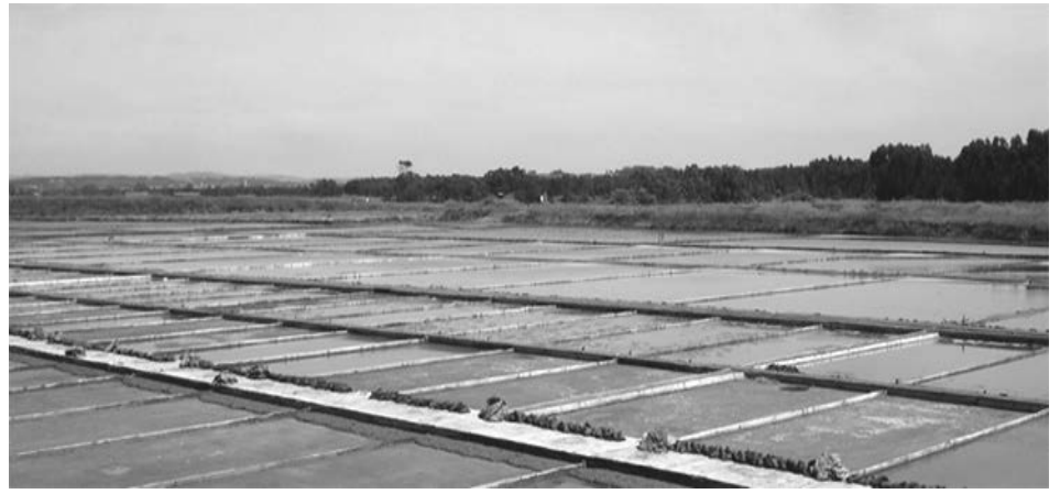
Figure 2. Salinas Corredor da Cobra in Figueira da Foz.