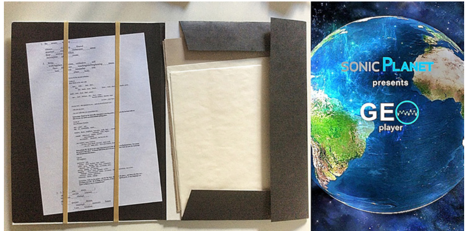
[Fig. 5] The envelope/sketchbook (image on the left) and the application used to apply the sound piece at the location.

envelope with different kinds of papers. The participants could use it as a drawing board, a notebook or even a container of material and immaterial elements of the landscape. The brief was also scored in a choreographical way. It was re-written in a more abstract way focusing on bodily actions.