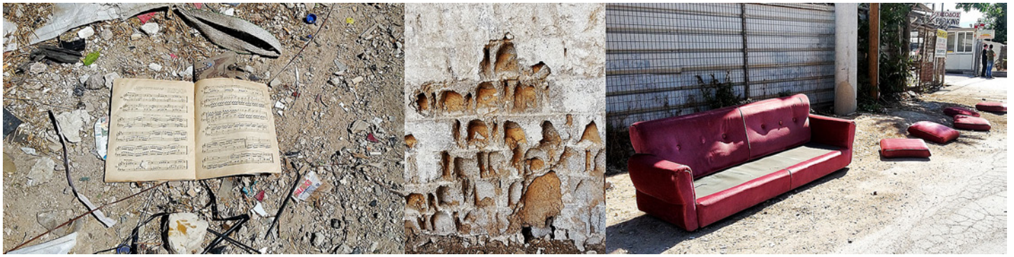
[Fig. 4] Scattered items, signs of deterioration on the buildings' walls and trivial objects dispersed in the streets are just a few of the unexpected encounters with the reality of Elaionas.