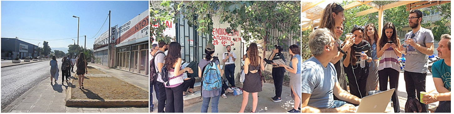
[Fig. 6] Students are shown walking down Iera Odos, getting instructions, receiving their envelopes and downloading their sound recordings to the organizing team's computer.

express it by answering the questions: “where do you come from?”, “where would you choose to live in the area?” and “how would this place would be going to be lived?”. The students were asked to answer to questions of possible familiarity, affinity and proximity with Elaionas in an imaginative way and translate it through the narrative and representational techniques they wanted.