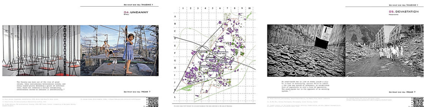
[Fig. 9] Student project from workshop (E. Kr.).

Collages were used by most of the students to illustrate Elaiona's affinities with other existing or imaginary landscapes. In the case of K.V. the natural milieu of Elaionas brought back the image of a Klimt painting. Drawing sequences were also used to reconstitute human activity from random traces. In the case of Ph. Ch., the drawing sequence shows a man waiting at a corner, a story improvised out of the infinite cigarette butts found on the spot [fig. 8].