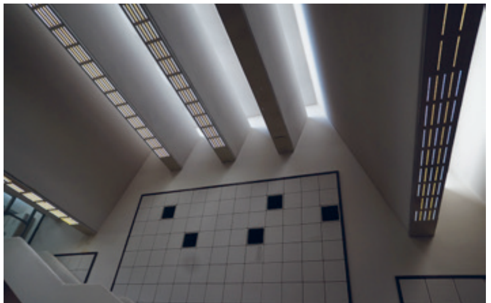
[Fig. 7] Jørn Utzon. Mellat Bank, Tehran, 1958-60.

Utzon's respect for the first generation modernists in general, and his interest in North African and Middle Eastern architecture in particular. And naturally light is what brings life to the sculptural tendencies, which Giedion lists as one of the trends among the Third Generation architects. Of Utzon's built projects, The Mellat Bank Tehran University Branch building (1958-60) exemplifies this approach, among many, while also intensifying the sculptural features of the bank hall ceiling, in terms of both tectonic and poetic expression.