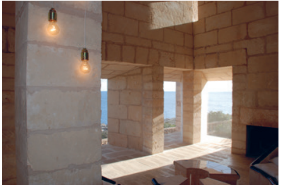
[Fig. 4] Jørn Utzon. Can Lis, Mallorca, 1971-73.

Utzon: La luz definidora de la Tercera Generación