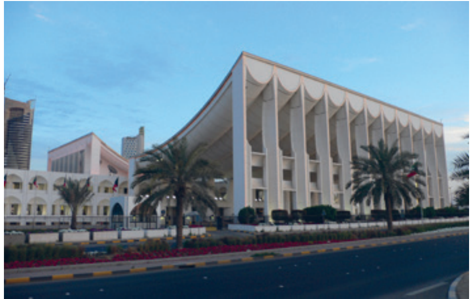
[Fig. 9] Jørn Utzon. Kuwait National Assembly, 1972-82.

On the dense urban site of the Melli Bank, a logical solution was to provide illumination from above, but it also is reminiscent of the bazaars and mosques Utzon visited in Iran and was particularly inspired by in Isfahan [fig. 5]. One approaches it from an entry plaza and a platform on a monumental staircase, which Utzon created by a setback from the façade line of the neighbouring buildings and separated from the busy street by a row of trees [fig. 6]. (The monumentality of the staircase has now been compromised by a ramp, but the trees are still there, though grown so big that it is hard to see the building.) The first spatial sequence inside is compressed under the two administrative floors above the entry, after which the three-story high banking hall on a four steps lower level opens as a dramatic contrast. The skylights between several parallel, post-tensioned concrete beams create an almost rhythmical pulse of musical notations in the high ceiling – or the Bank’s name in the flow of its Arabic script, as Weston among others has suggested – crossing the 20 metres free span of the bank hall between the flank walls on both sides, clad with lines of travertine 13 [fig. 7]. These walls protrude to the sidewalk and include the “servant spaces”, to use Kahn’s terminology, such as offices and other utilitarian rooms.