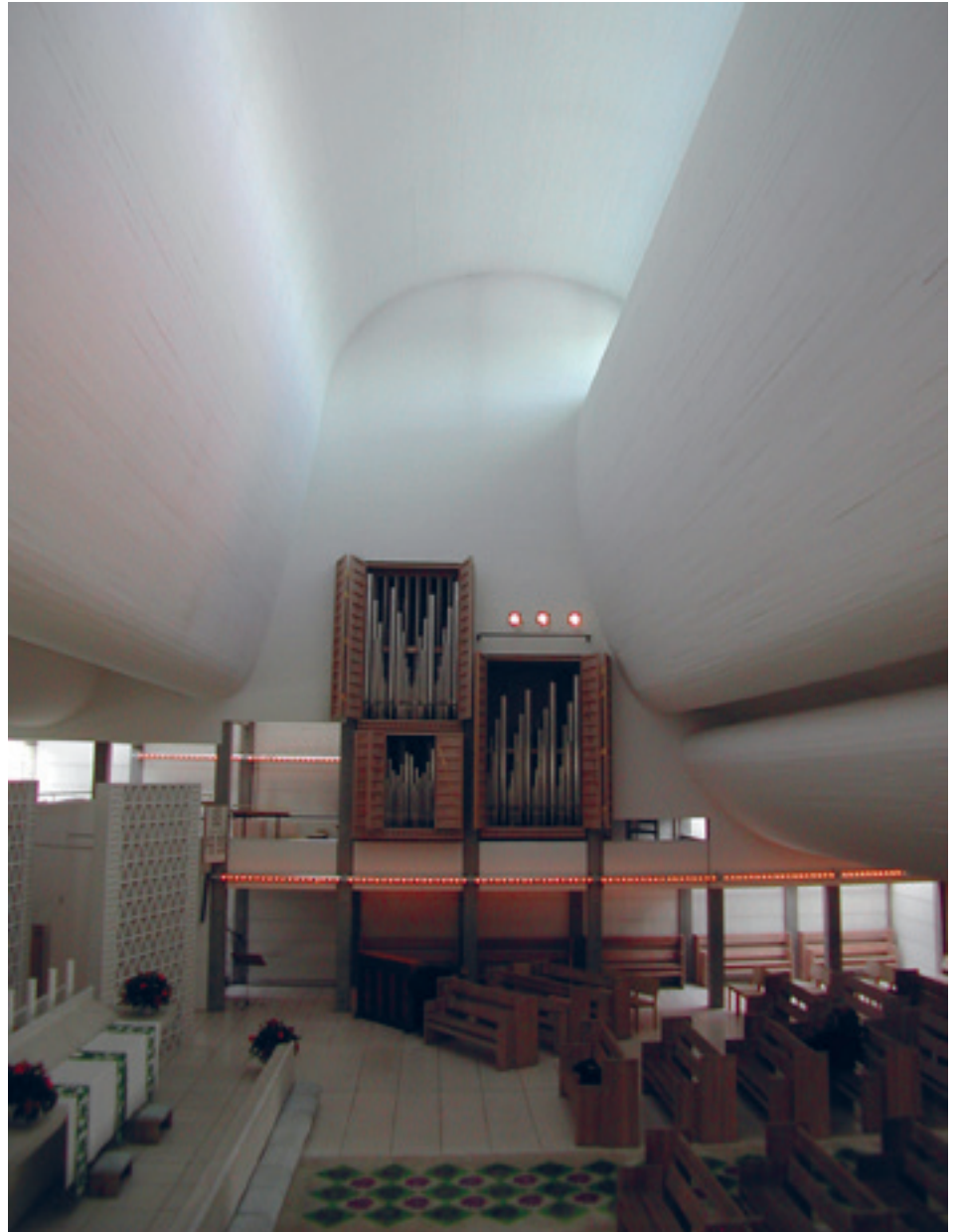
[Fig. 11] Jørn Utzon. Bagsværd Church, 1974-76.