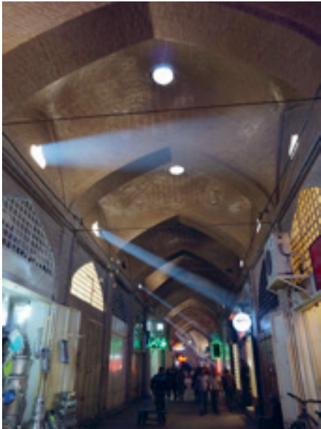
[Fig. 8] Isfahan Bazaar.