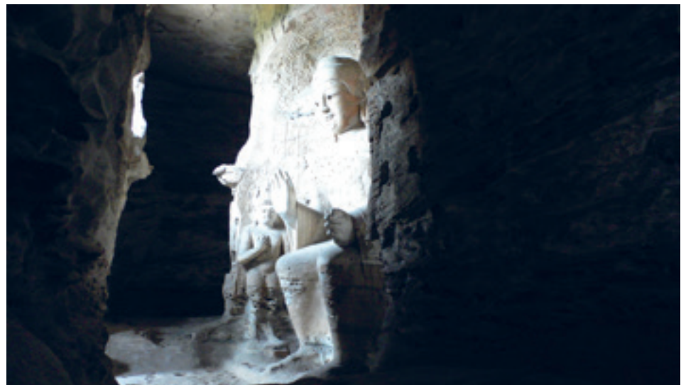
[Fig. 15] Yungang caves, Datong, China.