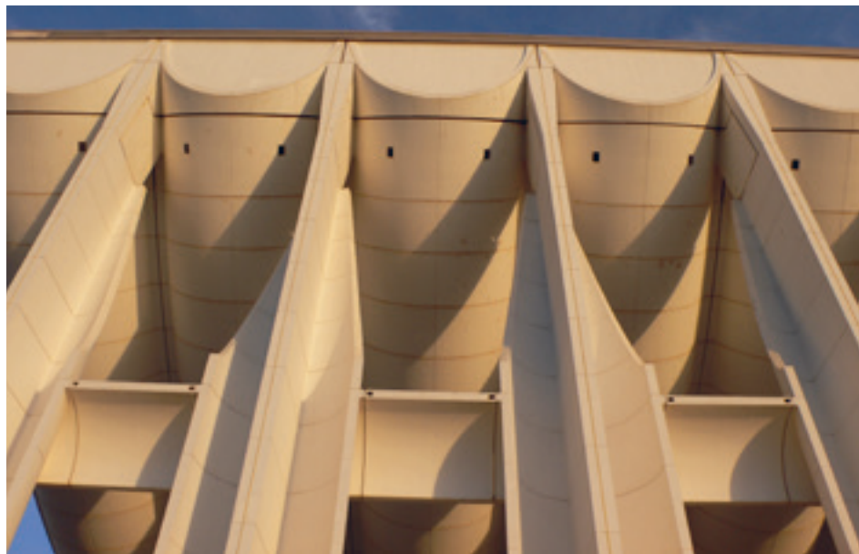
[Fig. 10] Jørn Utzon. Kuwait National Assembly, 1972-82.

In the Utzon Logbook IV , Utzon is quoted as saying that “All departments of the building (offices, meeting rooms, library, Assembly hall, etc.) are arranged along a central street, similar to a central street in an Arab bazaar” 17 with which he was now familiar after his first trip to Morocco in 1948, when Utzon lived in the desert nomads’ tents 18 , and then to Iran in connection to the Melli Bank project, among his many trips in the Middle East. As for the skylights of the Kuwait National Assembly, Utzon refers to shade rather to light, by stating that “The dangerously strong sunshine in Kuwait makes it necessary to protect oneself by seeking refuge in the shade” and also points out that the covered square “connects the building complex with the site completely and creates a feeling that the building is an inseparable part of the landscape” 19 , which corresponds to Giedion’s description of the interplay of architecture and environment [fig. 10].