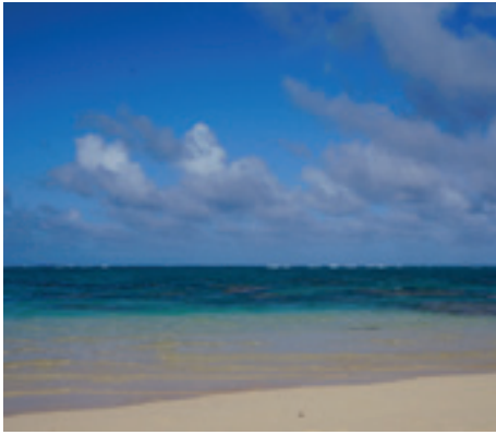
[Fig. 12] Lanikai Beach, Oahu, Hawaii.