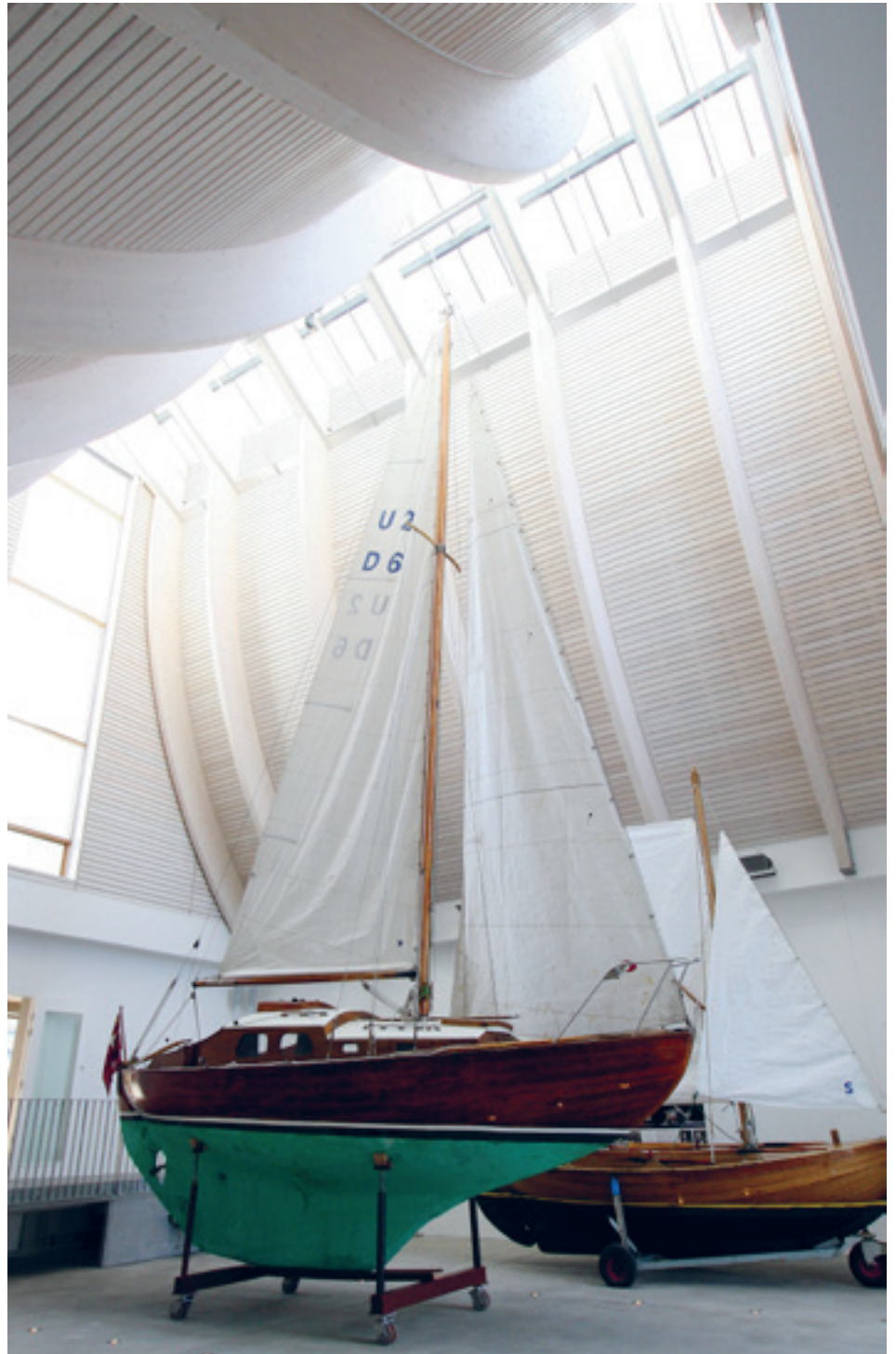
[Fig. 13] Jørn Utzon. Spidsgatter Hall, Utzon Center, Aalborg, 2008.