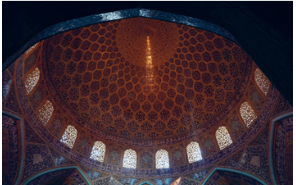
[Fig. 5] Sheik Lotfallah Mosque, Isfahan.