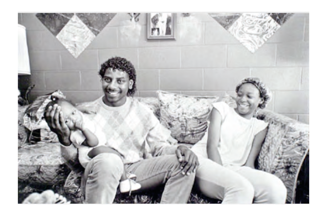
Figure 4. Marc PoKempner, Man holding baby, Cabrini-Green, 1988. Gelatin silver print. Museum of Contemporary Photography, Chicago.

the issues that she and Upton raised are crucial to reconsidering public housing in Chicago and the impact of women's organizing efforts on their own homes. From the role that race plays regarding access to (or within) public and private spaces, the ways in which the inhabitant helps shape space based on everyday use, and the layout of spaces and communal areas across gendered lines, both the 'homeplace' and the 'cultural landscape' center around the inhabitant's power to effect change on domestic architecture. The notion of the home or "homeplace" as a site of resistance plays an important part in both scholars' work, and in the story of activism in Chicago public housing.