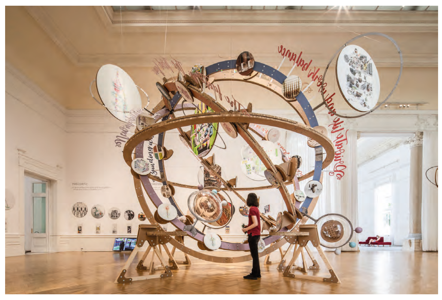
Figure 2. Image of Cosmowomen exhibition at La Galleria Nazionale d'Arte Moderno e Contemporanea di Roma.

from the school of Madrid, he told me, "No, she's not really interested in doing architecture; she's just in theory." This has been said by many architects to clients and people in the administration – it's a way of not having you hired. It's a super aggressive thing, a super dirty game. Super dirty.