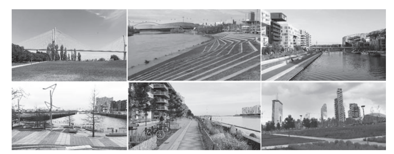
Figure 7. New parks and public spaces in Lisbon, Zaragoza, Lyon, Hamburg, Copenhagen and Milan.

recent projects have not had the same media impact as previous projects. The MUCEM in Marseilles, the Musée des Confluences in Lyon or the Museum am de Stroom in Antwerp have not had the same repercussion nor are they as internationally known as the Guggenheim in Bilbao. Nor have more recent exhibitions, such as the Zaragoza Expo 2008, received the global attention they once did. Nor are there many studies that confirm the effects and improvements they produce at a regional or metropolitan level. Finally, the commodification of culture and the thematisation of the city that they tend to produce are also debatable.