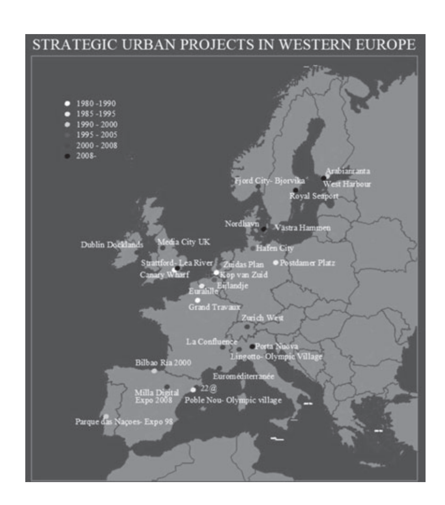
Figure 6. Location of some SUPs in Western Europe.