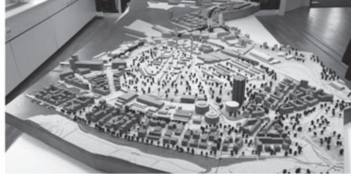
Figure 2. Some strategic urban projects: Zurich West, Nordhavn (Copenhagen) and Royal Seaport (Stockholm).

planning; the recovery of historical heritage and an emphasis on the priority of urban regeneration of central and peri-central areas, as opposed to the expansion and growth of the peripheries produced in previous decades. It coincides with the perception of the city as a discontinuous, fragmented element and, therefore, the belief that the city's problems cannot be solved in their totality, nor with unitary conceptions, but only through partial actions. According to Secchi, 15 the fragment is what characterises the contemporary city. For Leira<sup>16</sup> urban planning had to be more strategic and selective, prioritising future goals and transforming this capacity into very clear and selected objectives, due to the scarcity of resources, not only economic but also in terms of mobilisation and organisation capacity. It was necessary to physically organise the future of large cities into a limited set of integrated actions that would allow efforts to be concentrated on specific points, as strategic lines for the evolution of the city.