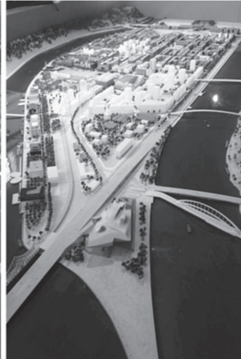
Figure 1. Some strategic urban projects: Euralille, Hafen City (Hamburg) and La Confluence (Lyon).

processes of 'urban rehabilitation', 'urban renewal' and 'urban remodelling', as well as the 'redevelopment' and 'urban remodelling' of urban areas". In the case of industrial land we would be referring, according to Moya, more to a reconversion.