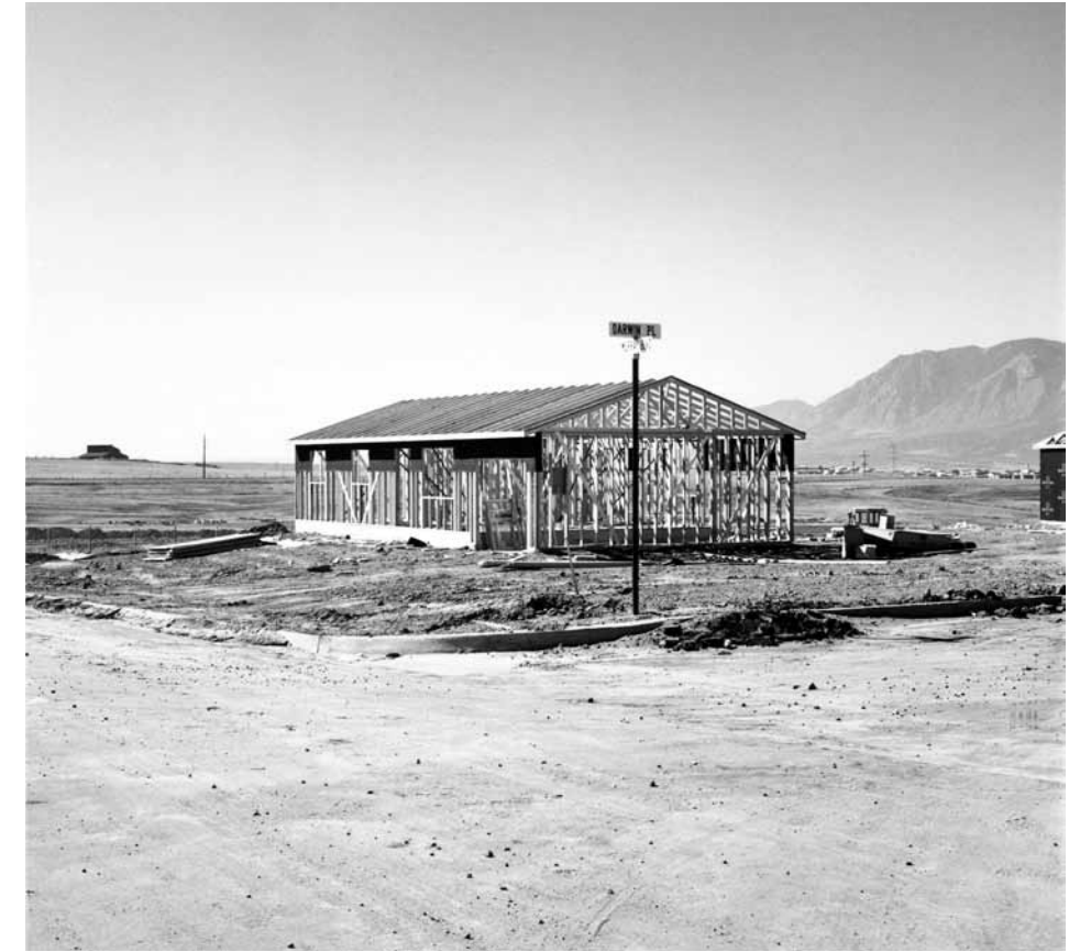
[Fig. 1] Robert Adams: Frame for a Tract House, Colorado Springs, Colorado, 1969 . Gelatin-silver print, 6" x 5-7/8".