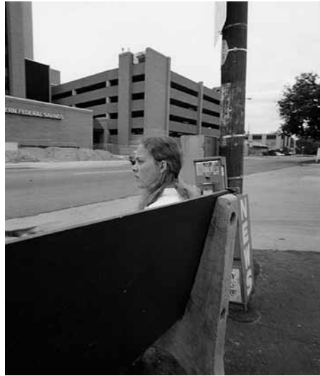
[Fig. 11] Robert Adams: Denver, Colorado , 1981. Gelatin-silver print, 7-1/4" x 6-1/4".

From the book: Our Lives, Our Children: Photographs Taken Near the Rocky Flats Nuclear Weapons Plant, Aperture, 1984.