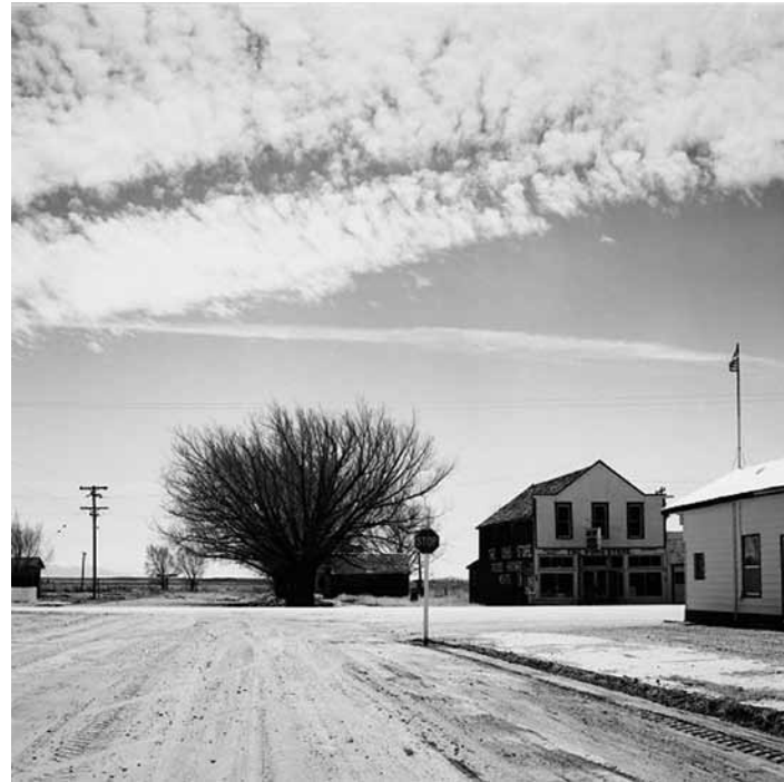
[Fig. 4] Robert Adams: Denver, Colorado , 1981. Gelatin-silver print, 6-5/8" x 6-5/8".

Fuente: © Robert Adams. From the book: Our Lives, Our Children: Photographs Taken Near the Rocky Flats Nuclear Weapons Plant , Aperture, New York, 1984.