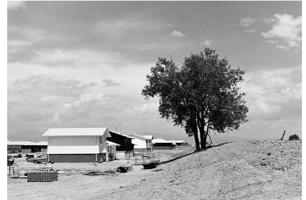
[Fig. 10] Robert Adams: El Paso County Fairgrounds, Calhan, Colorado , 1968. Gelatin-silver print, 6" x 7-1/2".