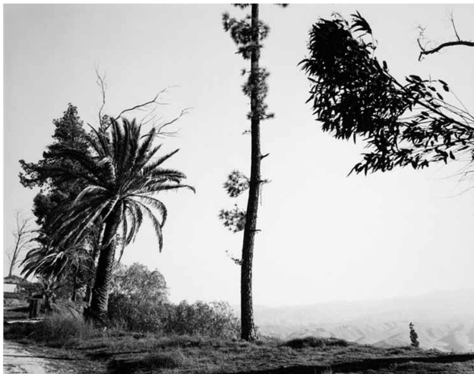
[Fig. 14] Robert Adams: Edge of San Timoteo Canyon, San Bernardino, California , 1978. Gelatin-silver print, 16" x 20".

From the book: Listening to the River. Seasons in the American West, Aperture, New York, 1994.