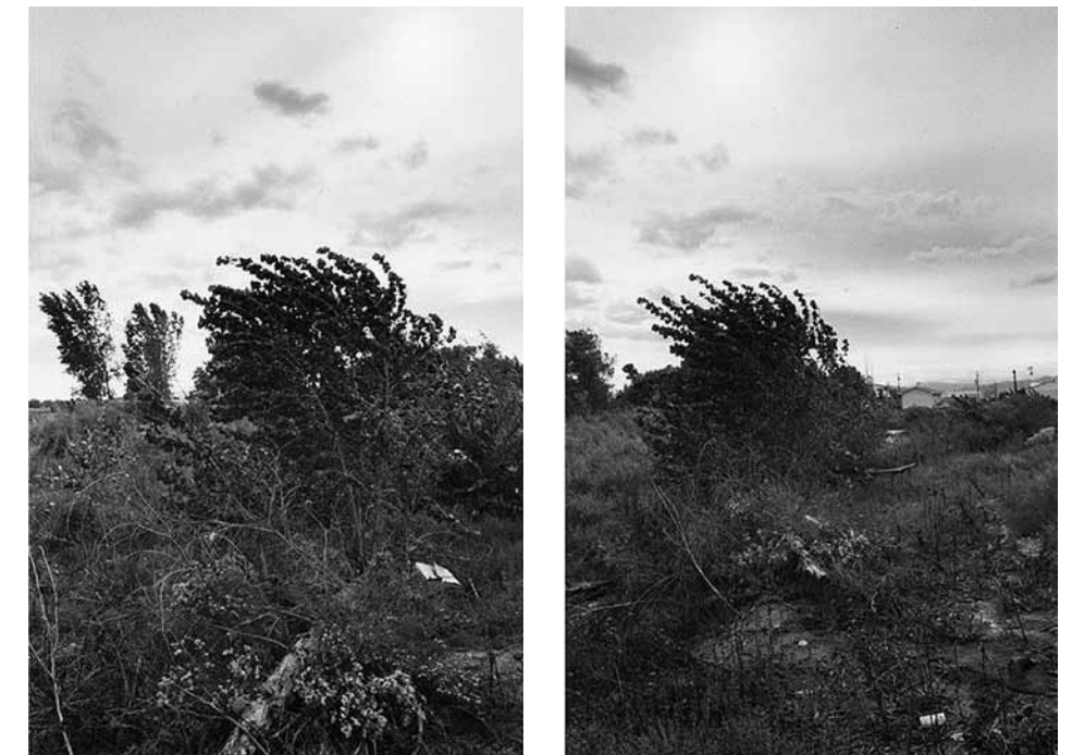
[Fig. 13] Robert Adams: Untitled , Colorado, 1994. Two gelatin-silver prints, 14" x 11".

Fuente: © Robert Adams. From the book: Listening to the River. Seasons in the American West , Aperture, New York, 1994.