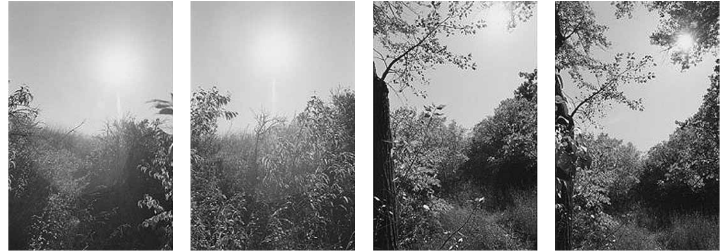
[Fig. 12] Robert Adams: Untitled , 1994. Four gelatin-silver prints, 7-3/4" x 5-1/8".

Robert Adams' photographs of the new western landscape attempt to preserve and reshape the definition of nature, and in so doing initiate a reconnection of