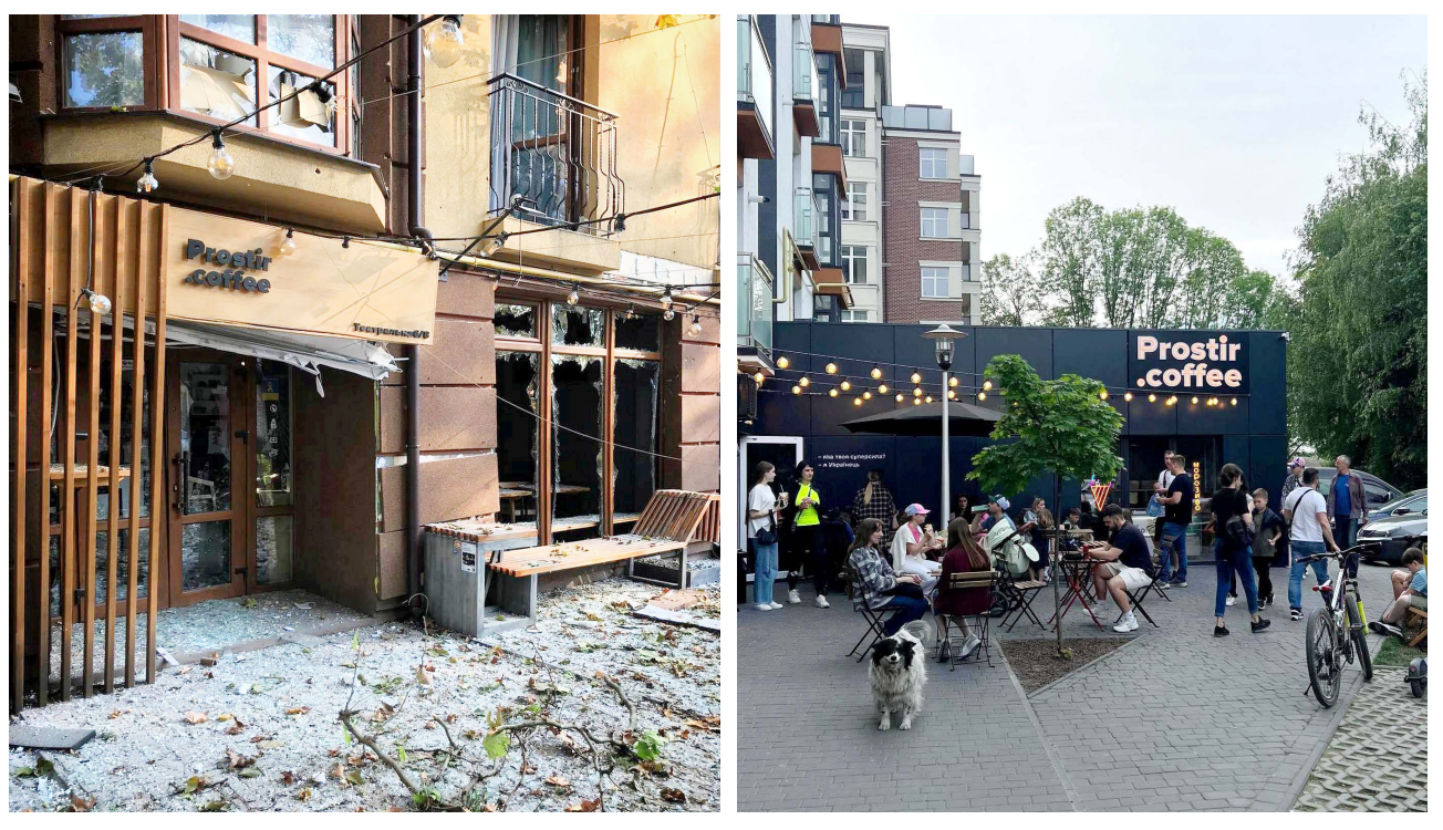
Figure 3. "Prostir.coffee" café: devastated in Kherson (a) and recreated in Ivano-Frankivsk as a catalyst for the emergence of a temporary public space (b).