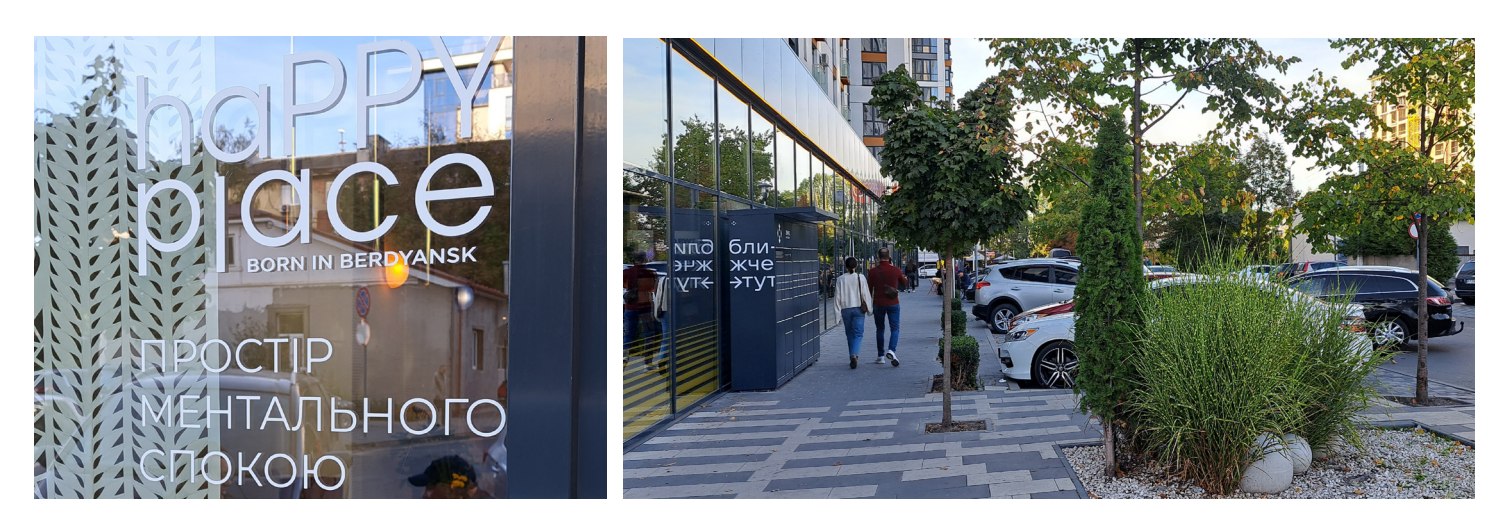
Figure 4. Kherson Street –a public space fostered by displaced small businesses in the city of Ivano-Frankivsk.